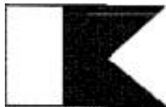
White Blue International Code Flag "A"

Must be displayed by all vessels operating in international waters. Flag A means that the maneuverability of the vessel is restricted.