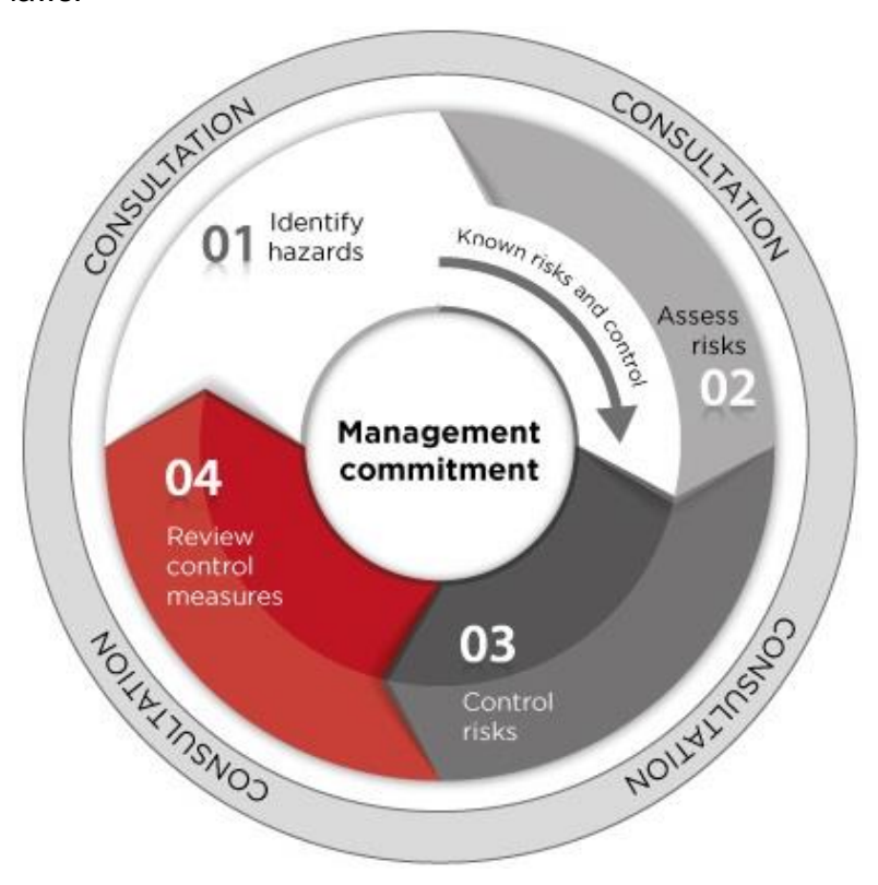
Figure 1 The risk management process

Further information is available in the Interpretive Guideline: The meaning of 'reasonably practicable'. The process of managing risk described in this Code will help you decide what is reasonably practicable in particular situations so that you can meet your duty of care under the WHS laws.