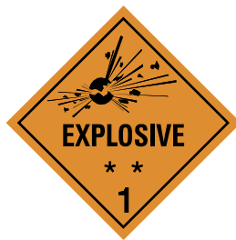
Division 1.1, 1.2 and 1.3